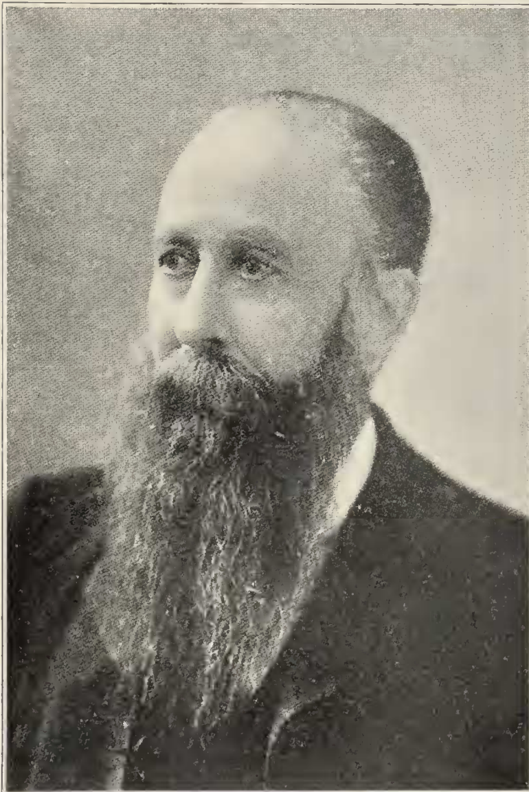
NATHANIEL STICKNEY GOSS, 1826-1891